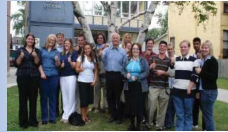
The 2006 YIP participants with NDP Leader Jack Layton!

Note: This session will be running through the Thanksgiving holiday which coincides with the Ontario Provincial Election.